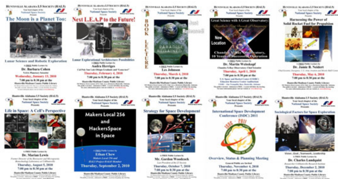
HAL5 2010 Monthly Program Flyers. See our website at www.HAL5.org for Larger Sizes and Past Flyers